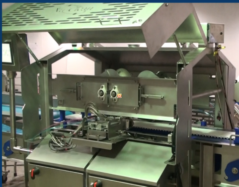
HOT BRANDER SYSTEM