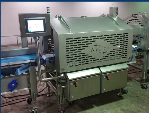
HOT BRANDER SYSTEM